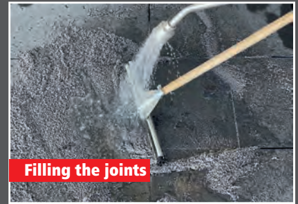
Filling the joints