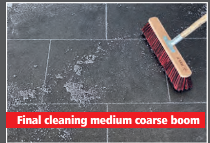
Final cleaning medium coarse broom